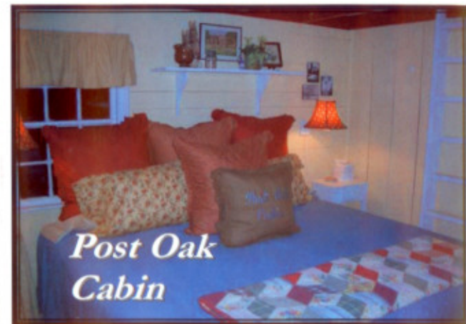
Post Oak Cabin

This 150 year old structure is tastefully decorated as a woodlands style country cabin with unobstructed views and more than 100 feet away from the Main House.